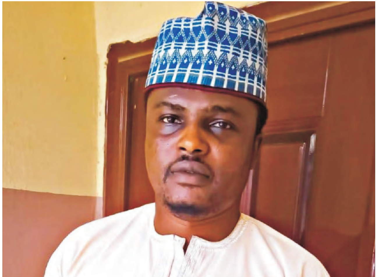
Hon. Shakiru Balogun

"Our party has permanent solutions and more to help the country prosper without any hindrance. I will advise our youths to join PDP. To actualise the dream for a greater Nigeria, let's collectively change the narrative."