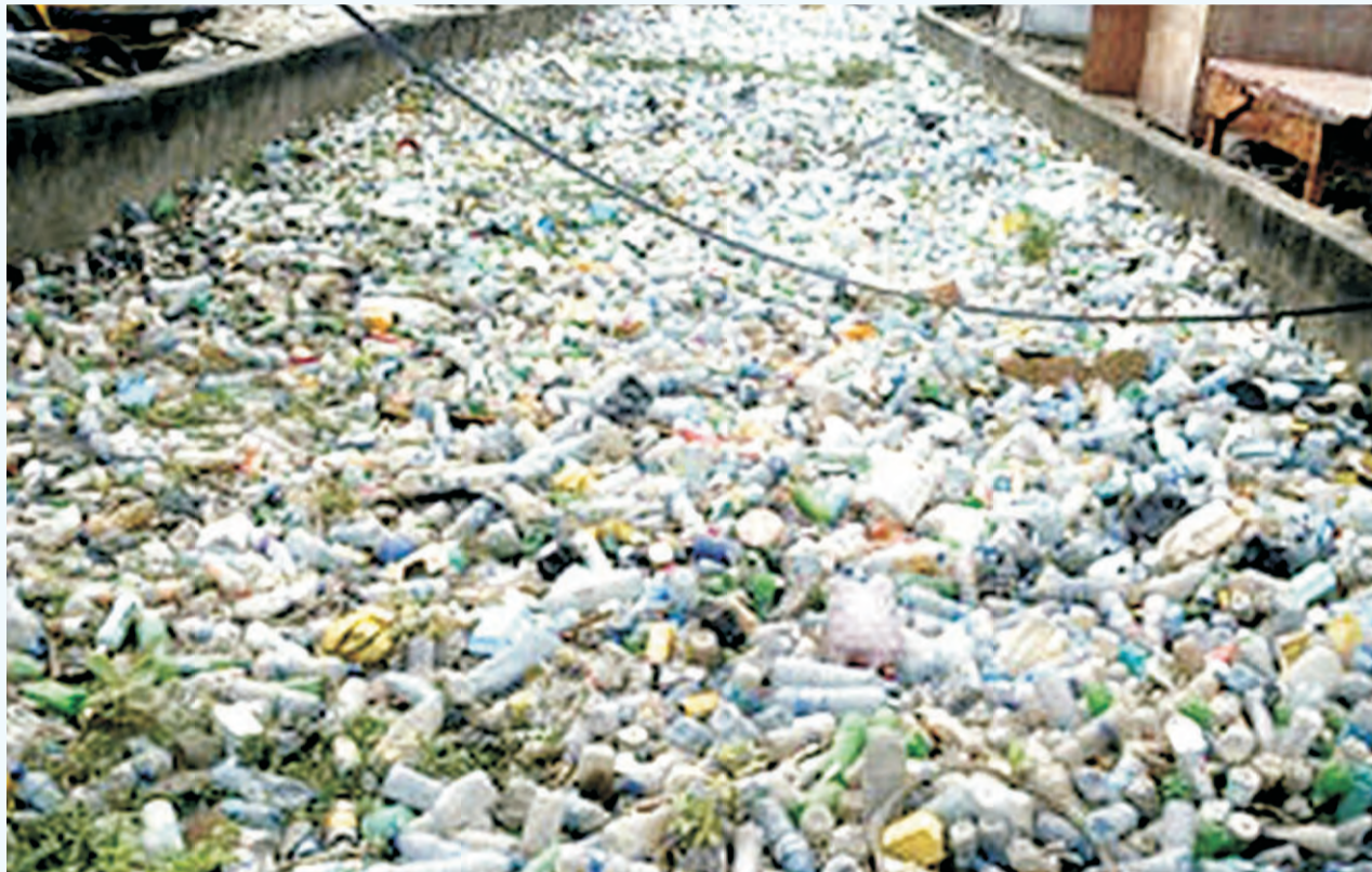
Plastic bottles, take away packs, major drainage blockage

He gave the warning following the increase in cases of flood in some communities in Oshodi, Isolo and Ejigbo, noting that many of the drains and canals have