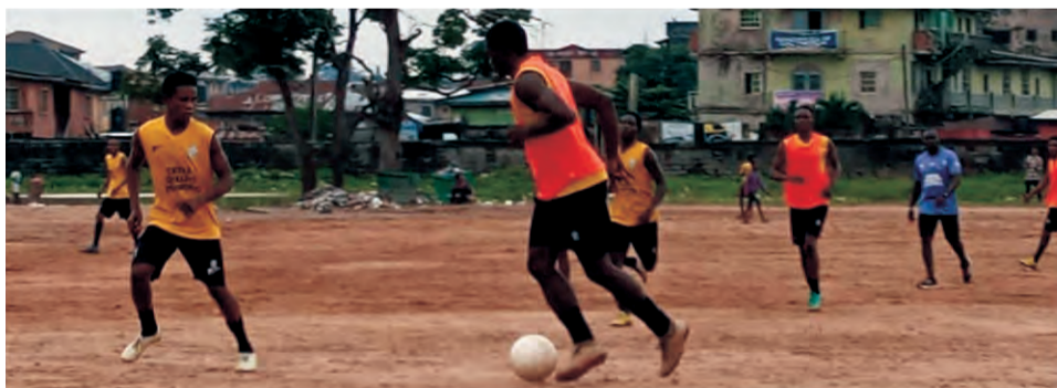
FC Robo Queens beat Fortune FA 3-1

F C Robo Queens are arguably back to form after winning two matches back to back to put past mistake past them as they topped up their game.