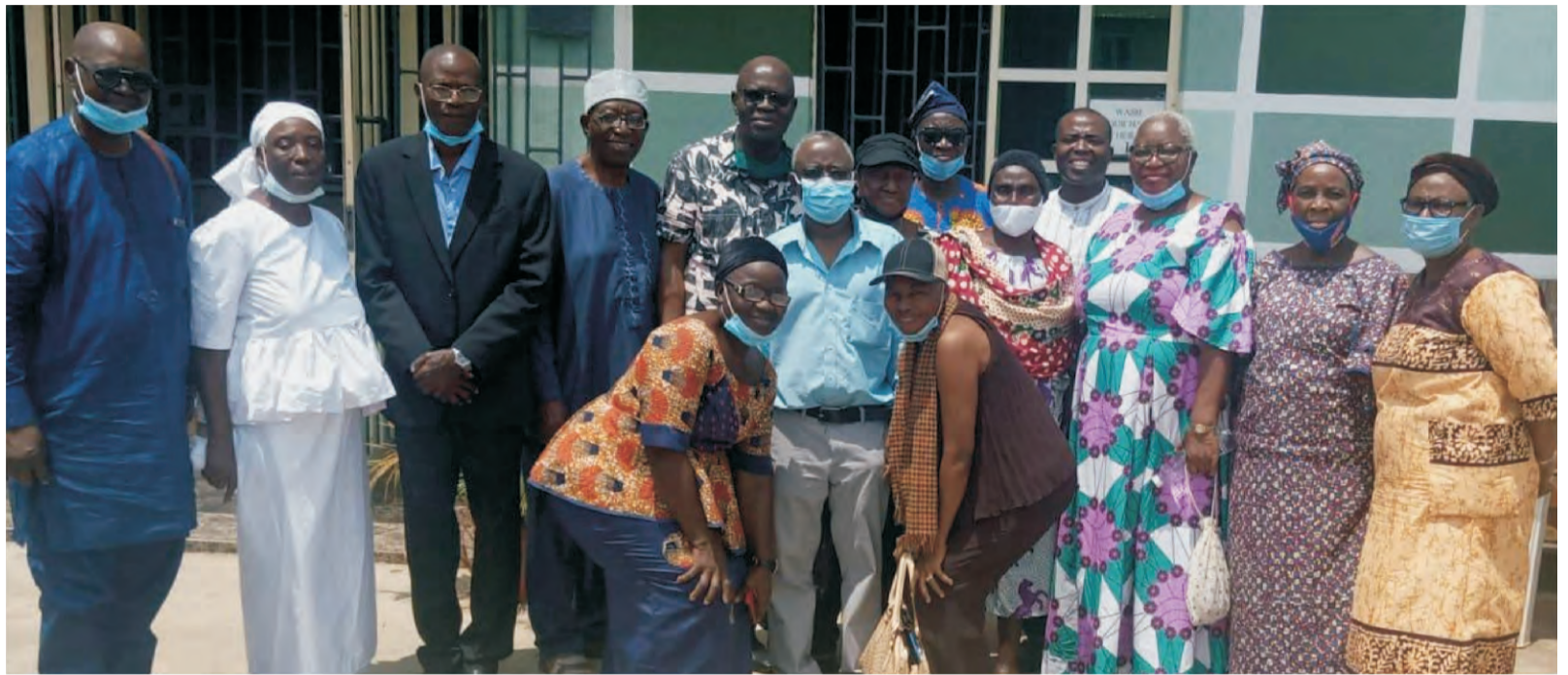
Members of the senior citizens, Ejigbo

While enlightening the elderly ones during a health lecture and awareness campaign organised by the health committee of Senior Citizens Foundation, Ejigbo, the medical expert warned that continuous use of the substances may damage